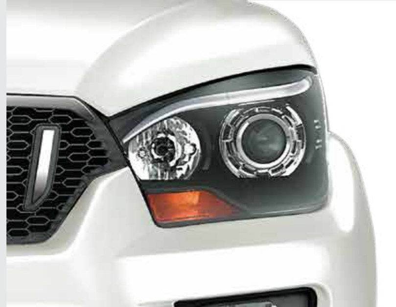
DUAL PROJECTOR HEADLAMPS WITH LED EYEBROWS

Clothes make the man but the car he drives reflects his soul and that's why we designed the Mahindra Pickup keeping two principles in mind, confidence and competence. It features an all new bold front grille with chrome inserts, rugged wrap-around bumpers and high performance dual projector headlamps with low-profile LED eyebrows and static bending technology that make sure that the path is cleared for your arrival.