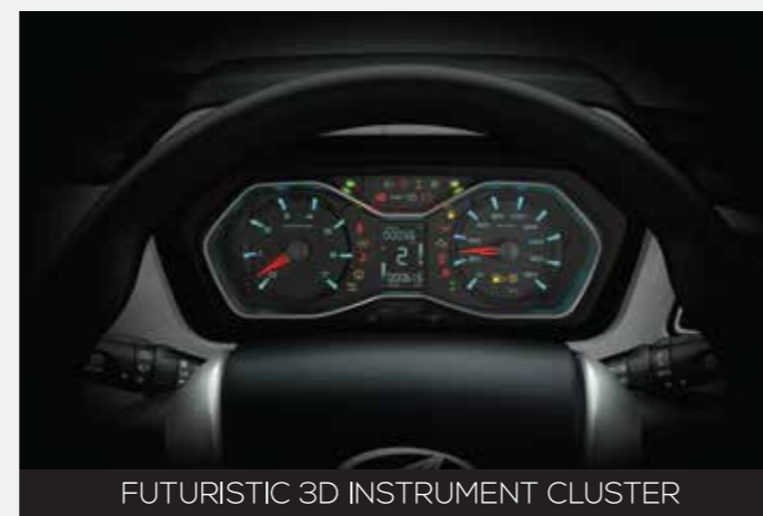
FUTURISTIC 3D INSTRUMENT CLUSTER