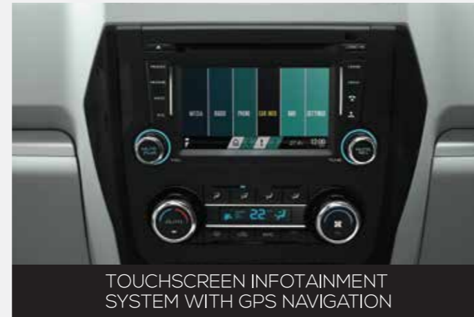
TOUCHSCREEN INFOTAINMENT SYSTEM WITH GPS NAVIGATION