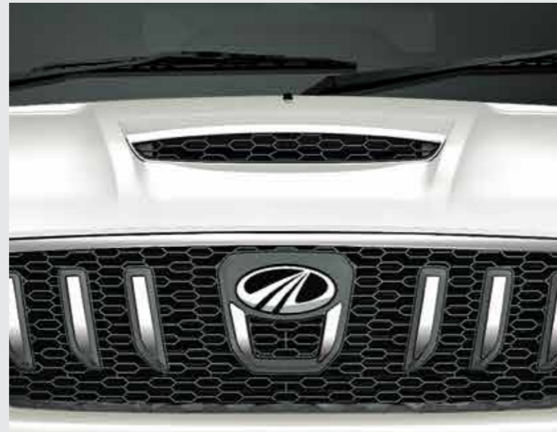
IMPOSING FRONT GRILLE