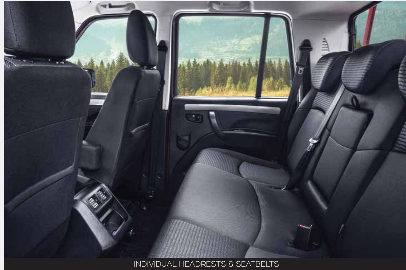
INDIVIDUAL HEADRESTS & SEATBELTS